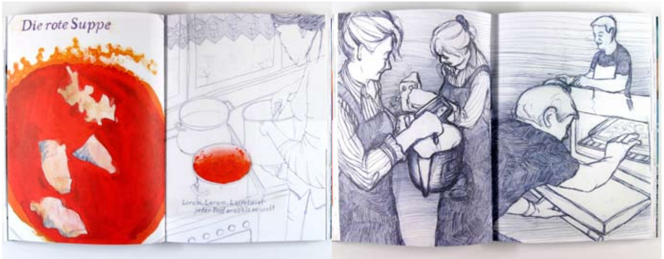
Example 13: “Here we only cook with love”. The illustrated “cookbook” is a document produced by a cooperative effort between art and art education students and the tenants of a high-rise complex on the outskirts of Vienna – a social hot spot with a high level of latent violence. Initial encounters in which cooking and eating together represented the central element of familial life led to stories about cooking and life that sketched an impressive portrait of the tenants and their worlds. By working jointly on the book, areas were opened up which the tenants had previously reacted to with disinterest or rejection, shyness or fear.

The use of new technologies can develop these projects considerably further and open up entirely new dimensions for communication and negotiation.