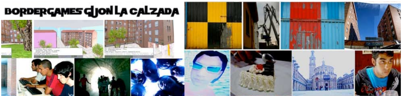
Example 12: Bordergames is a project to empower young migrants through the process of designing and programming a videogame fully made by them. Bordergames comprises a series of workshops, a videogame engine and an editor which allows young migrants not only to design a video game in which their experiences are the main element, but also to learn the importance of becoming familiar with new technologies and using them to self-organise and recover control over their own lives and environments. www.bordergames.org Spain

It is when resources become scanty and insecurity grows, when a lack of opportunities allows no visions of the future, that borders are closed up tight and there is a tendency to retreat behind hardened constructions of what is one's own and what is alien. Idealisations and demonisations are frequent side effects of this process. Deviations from what is familiar engender rejection and aggression, or are penalised with marginalisation. Discussions about identity and culture then often serve the purpose of justifying separation and exclusion. Cultural education programmes cannot work miracles, but they can introduce new perspectives, make restrictive views and actions perceptible, and challenge people to make a move – however small. In this sense they open up negotiation spaces, promote active debate and thus help to develop a conflict culture. (This can be compared to the work strategies of the Japan Foundation in the field of peacemaking.)